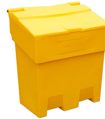
3 STS212510 – 200 Litre Grit Bin