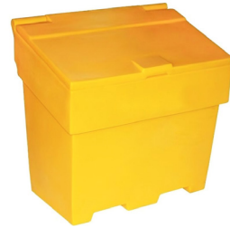
2 STS212505 – 169 Litre Grit Bin