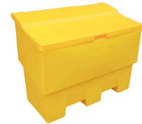
4 STS212515 – 285 Litre Grit Bin