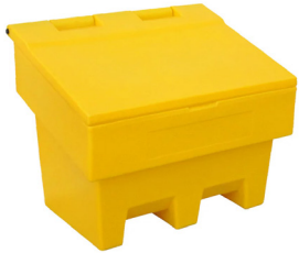
1 STS212500 – 100 Litre Grit Bin